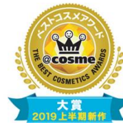
@cosme THE BEST COSMETICS AWARDS Logo

With that credibility, in Asia, especially in the Greater China region, many people seek to purchase Japanese cosmetics with the Best Cosmetic Award seal, which is proof that the product is supported by users on @cosme. In this way, it has become popular in places outside of Japan.